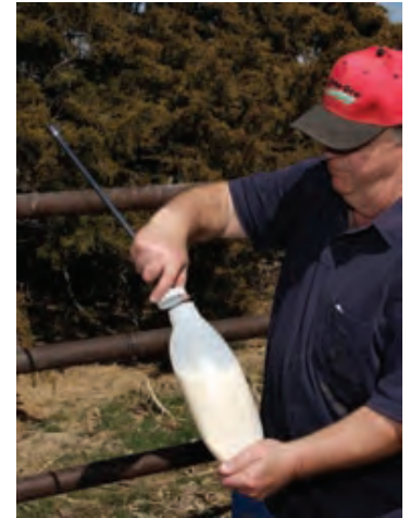
4. Screw probe assembly or nipple assembly onto 2 quart/1.9 liter tube.