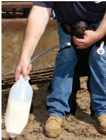
5a.* (Probe Style Only). Insert probe into calf's mouth guiding gently toward the calf's left side , staying on top of the tongue. The probe "finds it's own way" to the esophageal opening. Note: Keep fluid out of probe during insertion into mouth and esophagus.