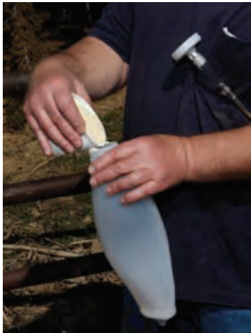
1. Pour measured amount of drench feed product into 2 quart/1.9 liter tube.