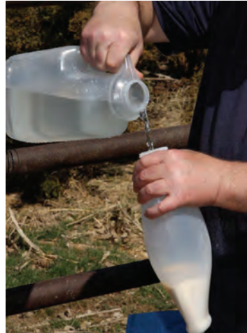
2. Add correct amount of water.