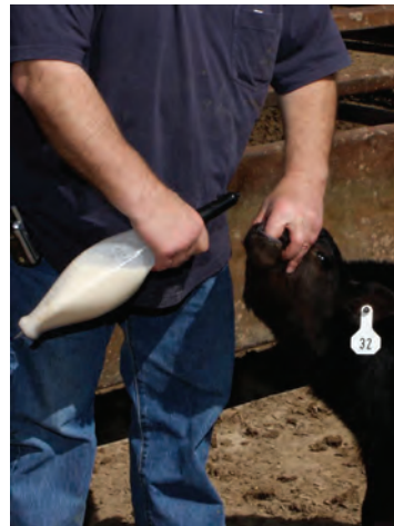
5b. (Nipple Style Only). Secure calf between your legs and put nipple in calf's mouth. Squeeze nipple between your finger and the calf's tongue until the calf starts to suck the nipple.