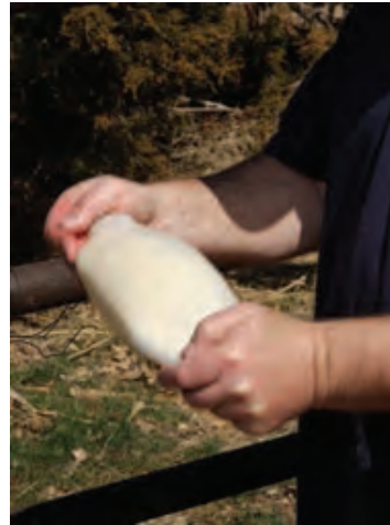
3. Cover tube or jug opening with hand and shake to mix contents.